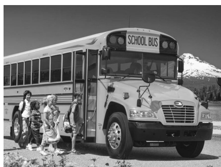
An American school bus