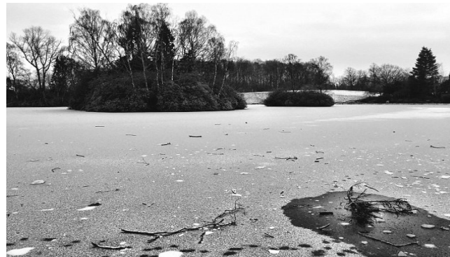
The icy canal in Hopewell, N.J.